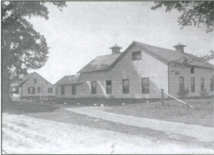
Main buildings of the State Game Farm on Copse Road in 1920